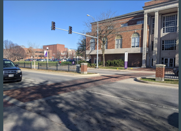
SUB to Centennial